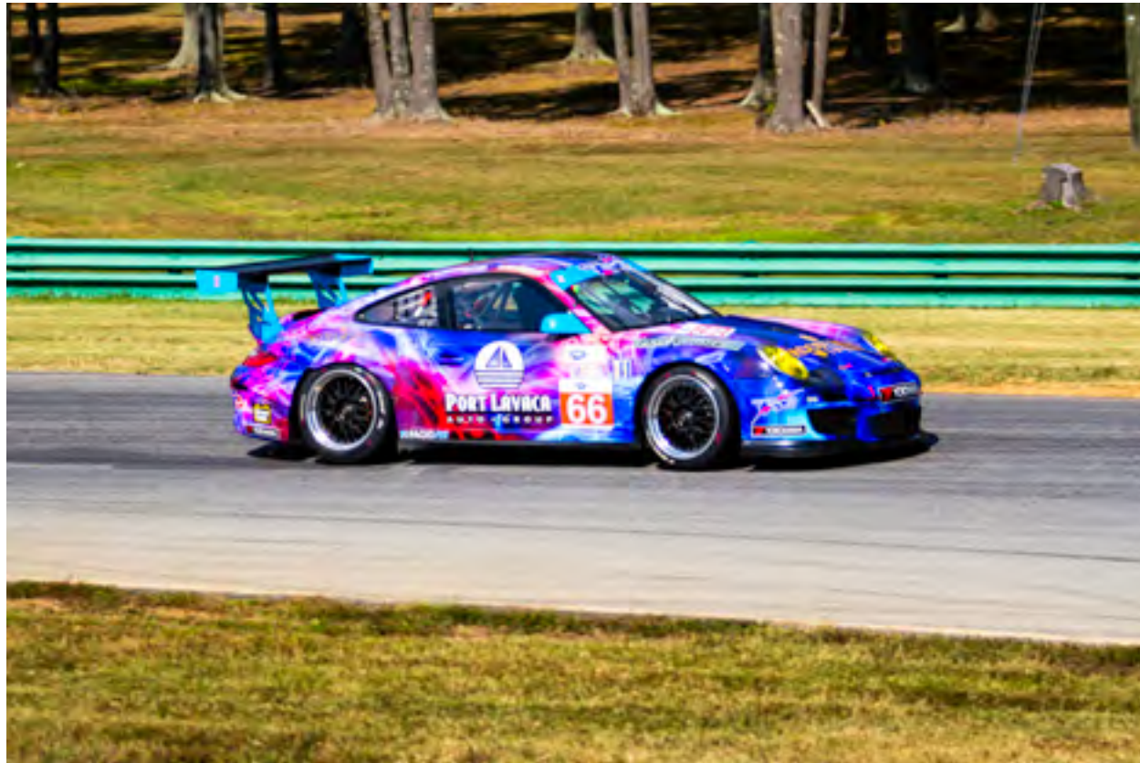
Left: (2013) A very colorful Porsche 911 from the The Racers Group on the racetrack during a race.