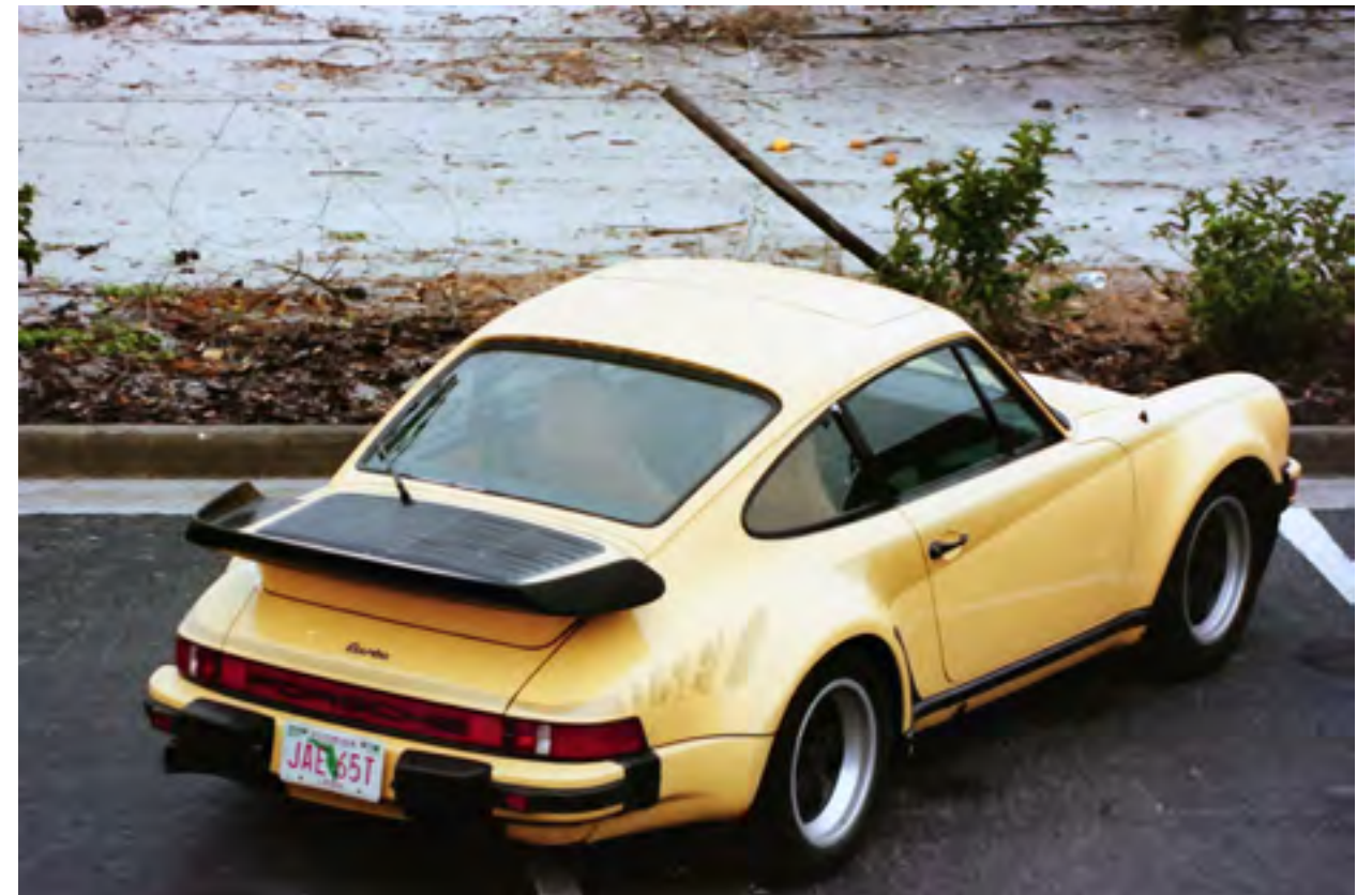
Right: (1988) Porsche turbo in the parking lot of the hotel in Winterhaven, FL. It was new then, and I wonder where it is today.