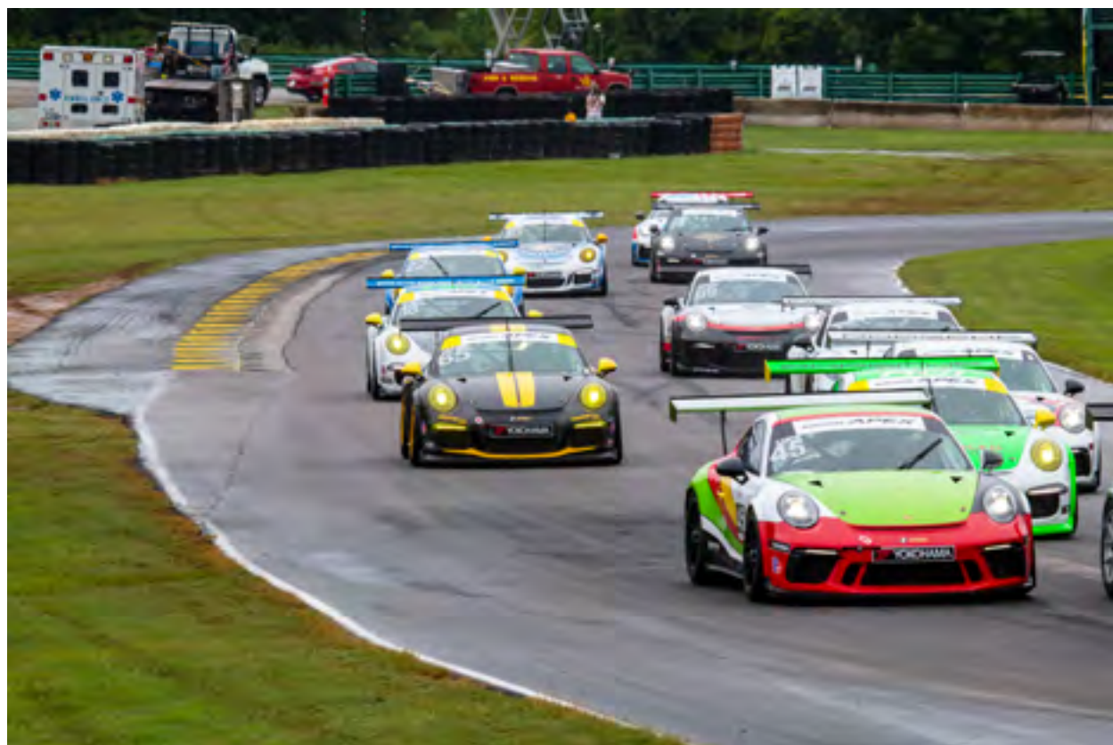
Left: (2019) The start of a Porsche GT3 Cup Challenge race. I bet a Porsche GT3 wins this race.