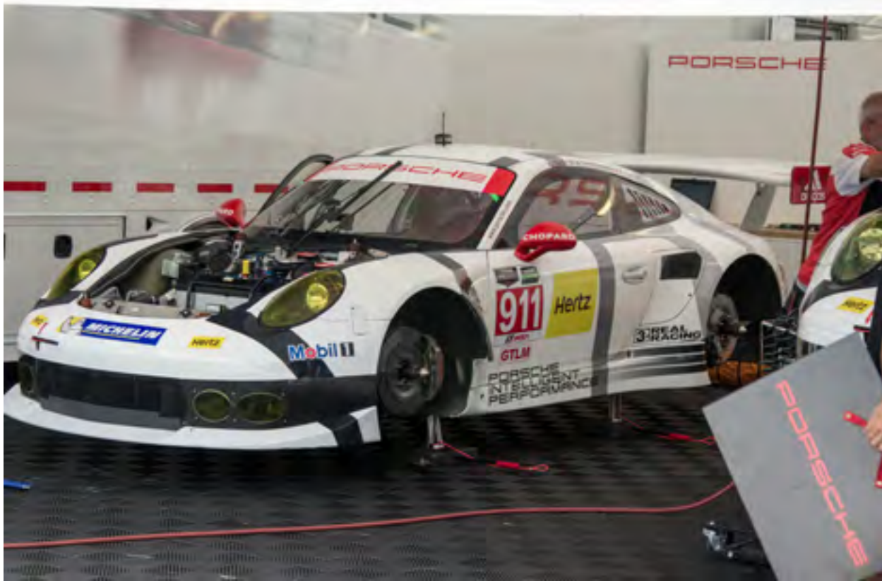
Left: (2014) In the paddock the Porsche #911 is prepared for the next round. Watching the paddock action provides insight into what it takes to prepare and maintain a race car.