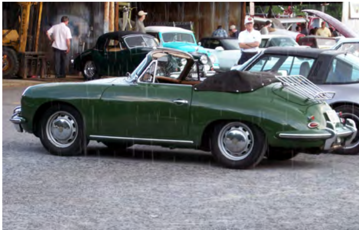
Left: (2006) The owner of this Porsche 356 was not around when the rain started at a New London Fly-In. It was very wet when he arrived to raise the top.