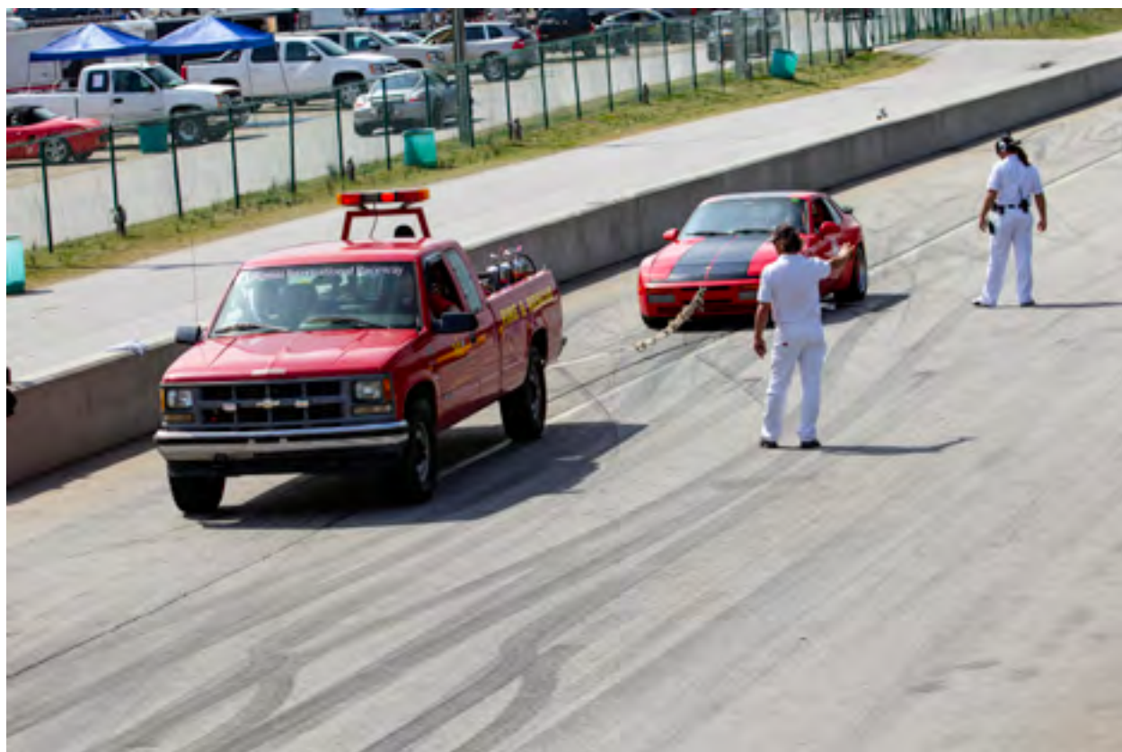
Left: (2012) The ultimate embarrassment, being towed back to the pits after a mechanical failure in this Porsche 944.