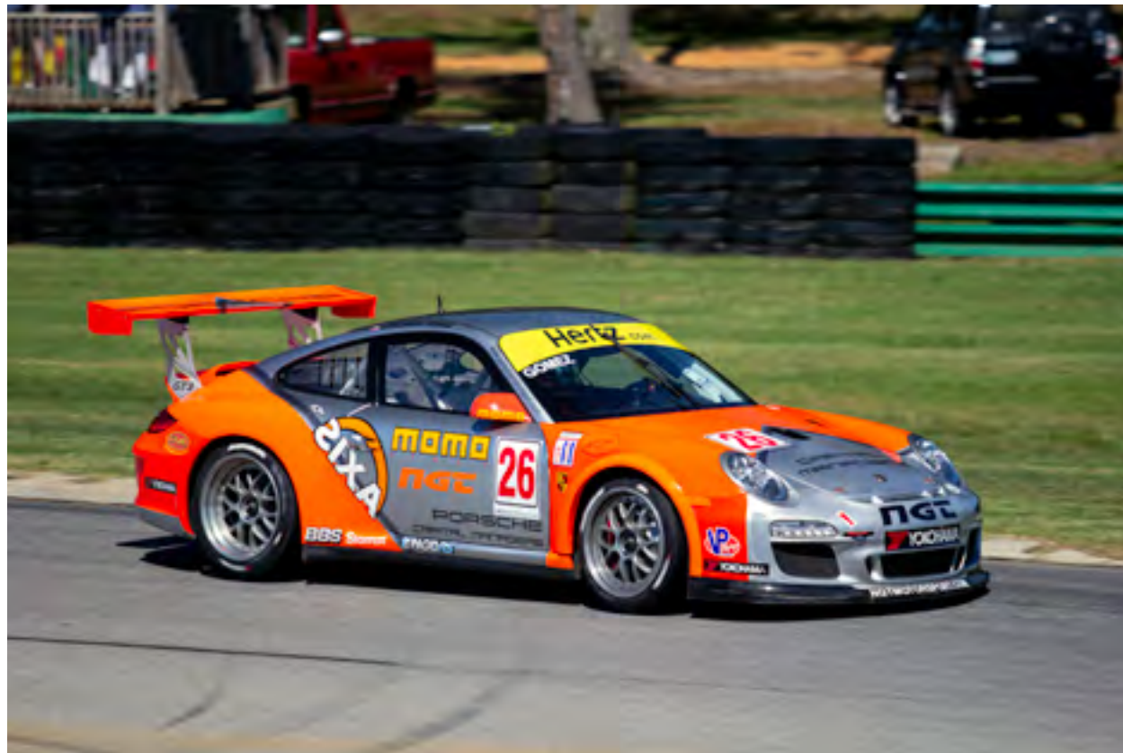
Left: (2012) A very colorful Porsche 911 from the Momo team on the racetrack during a race.