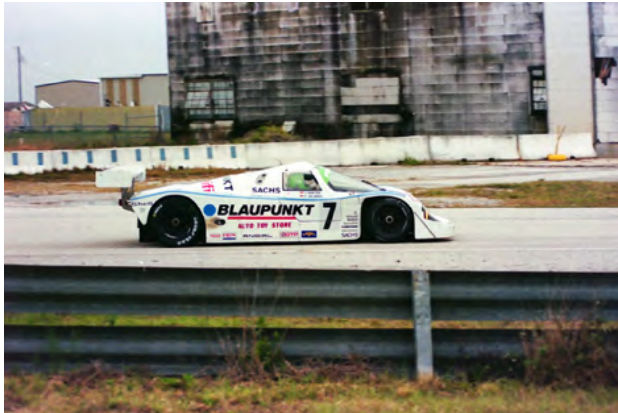
Left: (1988) Blaupunkt Porsche prototype at Sebring International Raceway in Sebring, FL. Many Porsche owners know that name from their car radio.