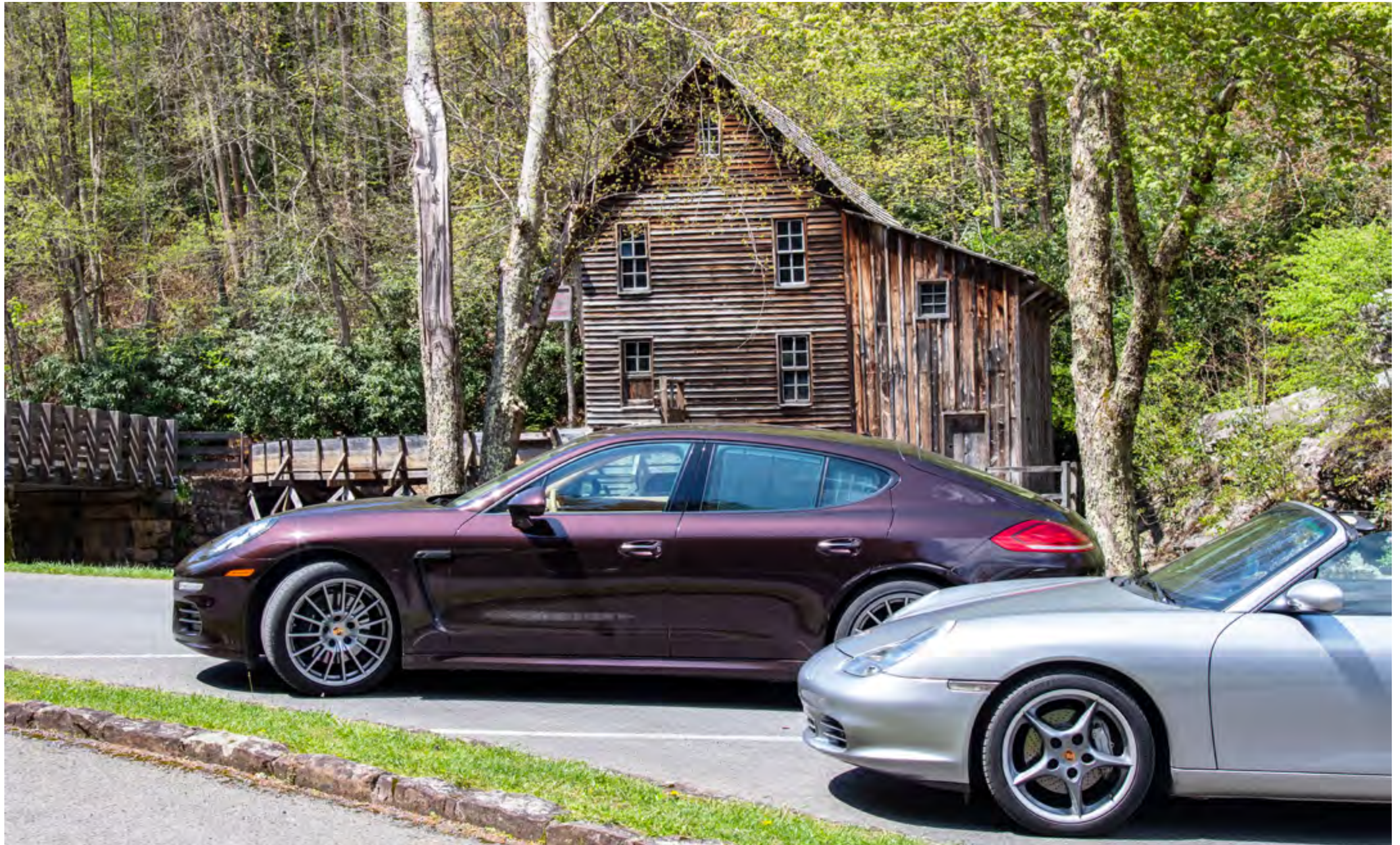
(2019) These cars stopped at this grist mill in Babcock State Park in Clifftop, WV. The mill has scenic views, and visitors can walk along the creek and walk to the mill. The Porsche 4-door sedan (left) is another vehicle type made by Porsche as the Panamera. Canon T7i, 24-105L @ 35mm, F6.3, 1/160 sec, ISO 100