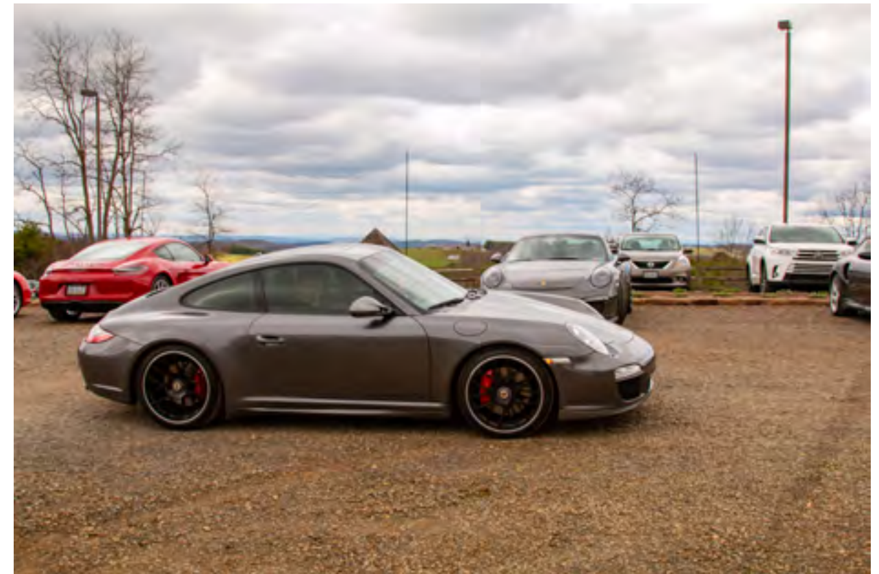
Right: (2018) Porsche 911 Carrera at an event at Chateau Morrisette in Floyd, VA. The color almost matches the sky.