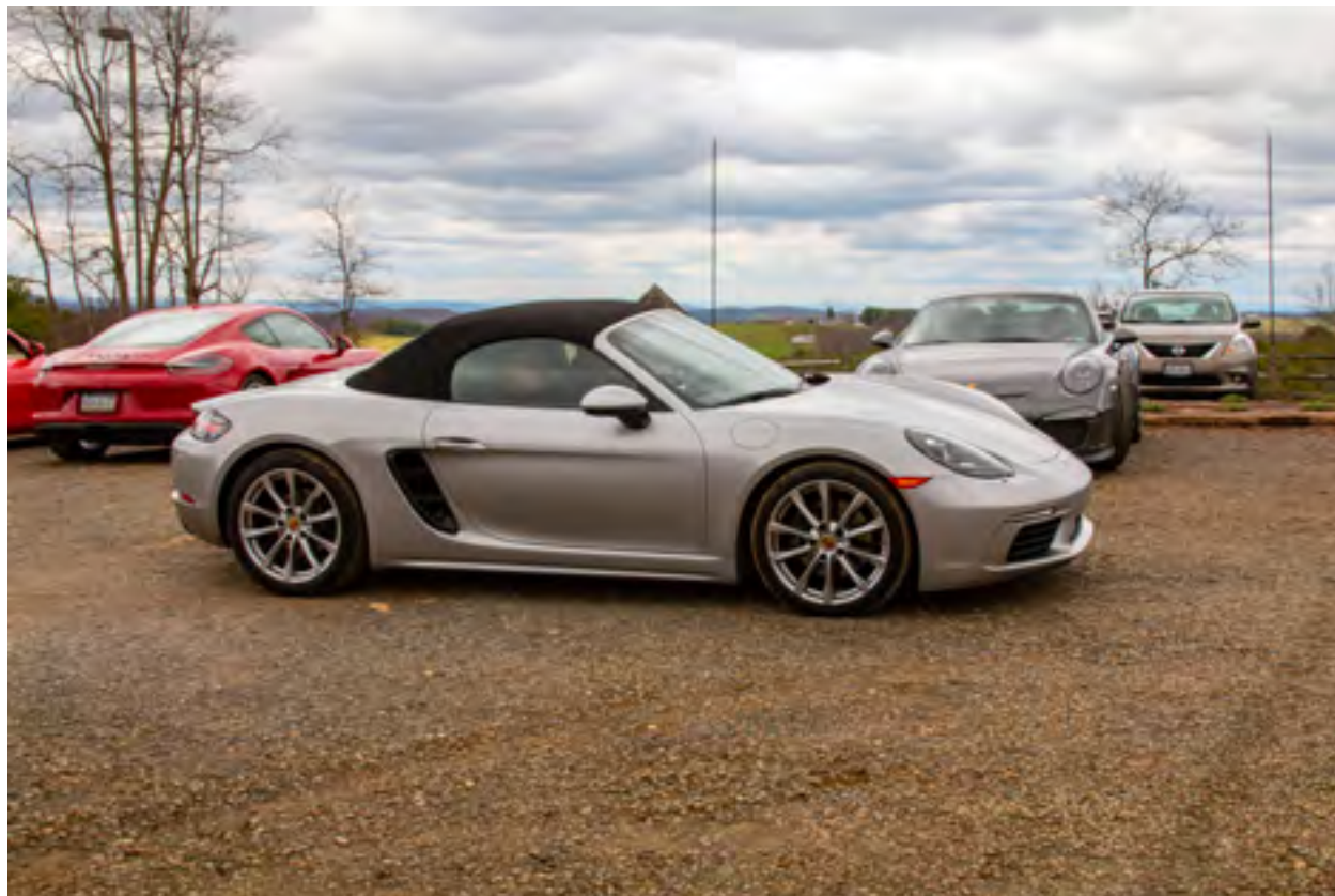
Left: (2018) Porsche Boxster at an event at Chateau Morrisette in Floyd, VA. It was too cold to have the top down this day.