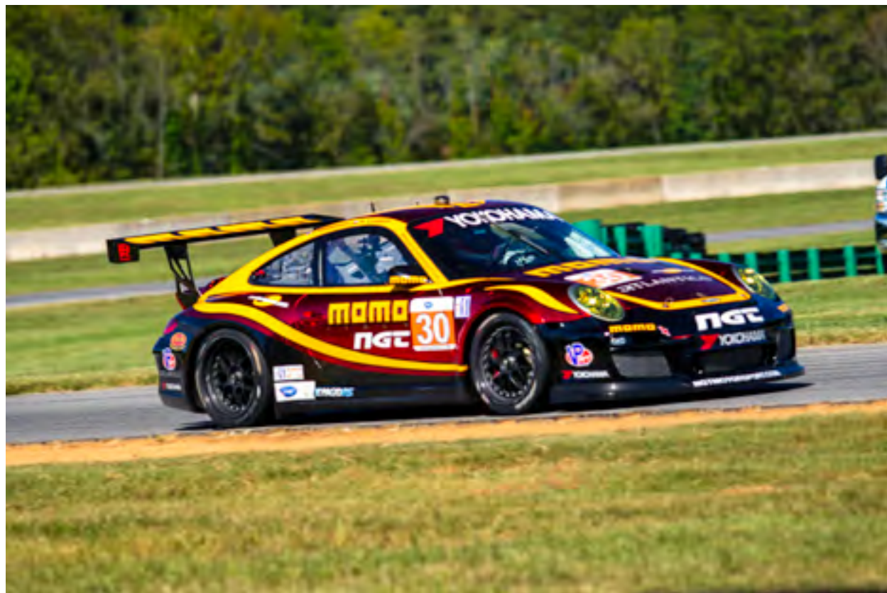
Left: (2012) A very colorful Porsche 911 from the Momo team on the racetrack during a race.