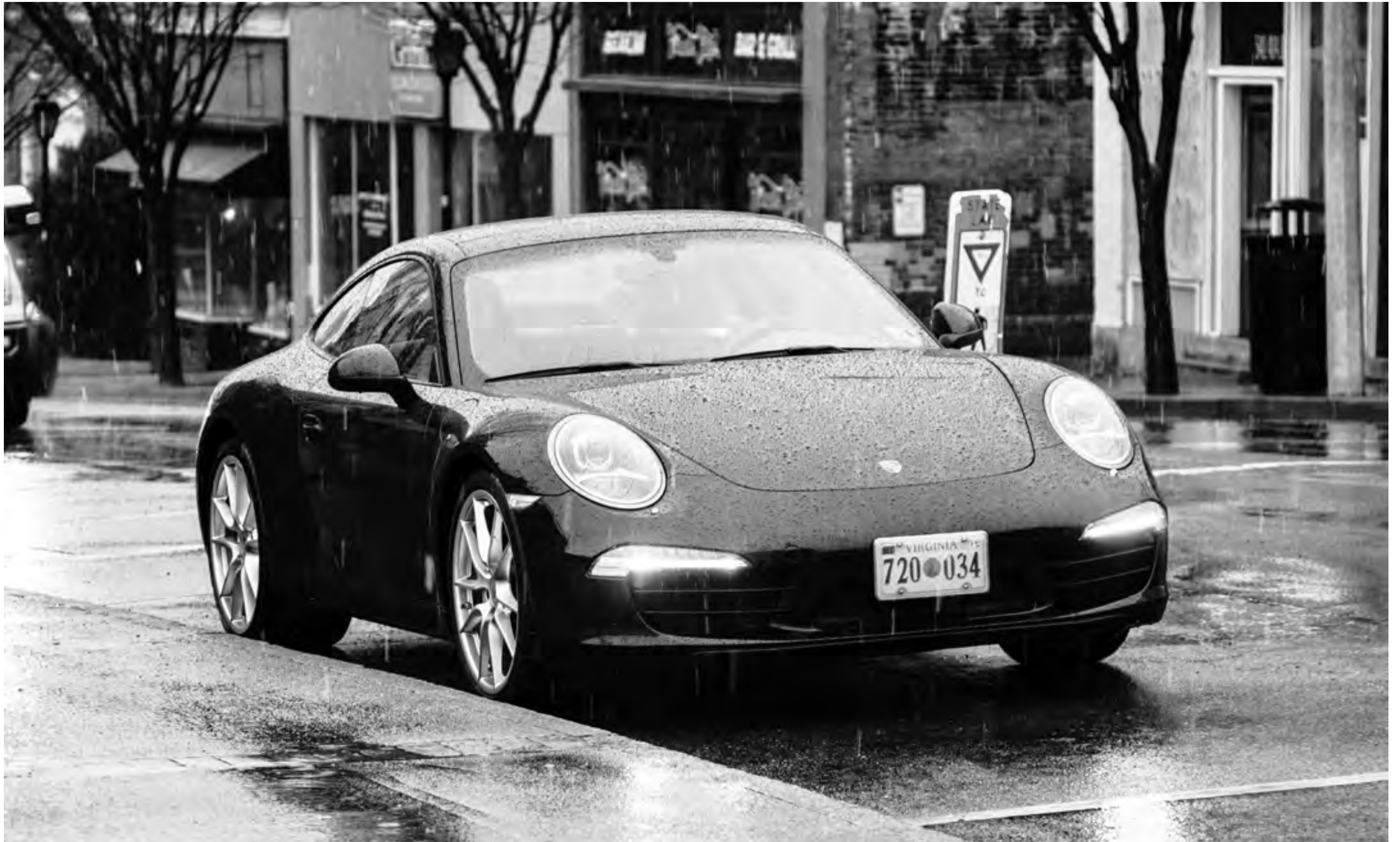
(2019) Even in rain mixed with snow the Porsche owner drove to an event in Roanoke, VA. In black & white the streaks of the snowflakes are more easily seen.