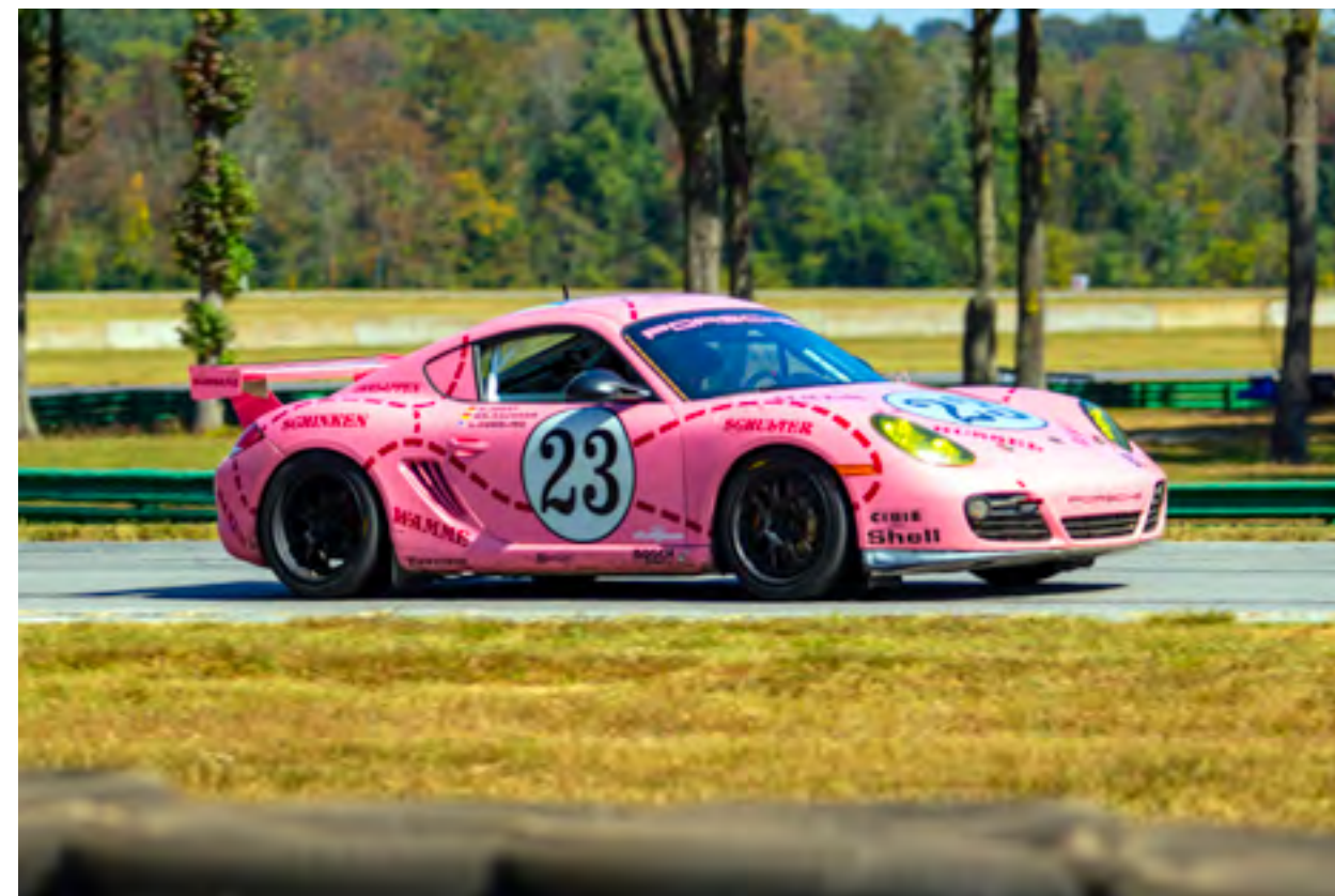
Right: (2013) This pink Porsche Boxster was driven by one of the few female drivers on the circuit.