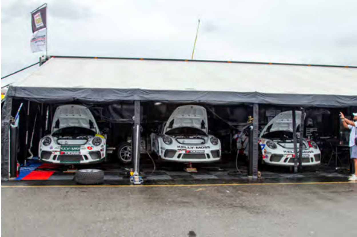
Right: (2019) That is how I want my garage to look. Three Porsche GT3 cars in my garage could make my day.