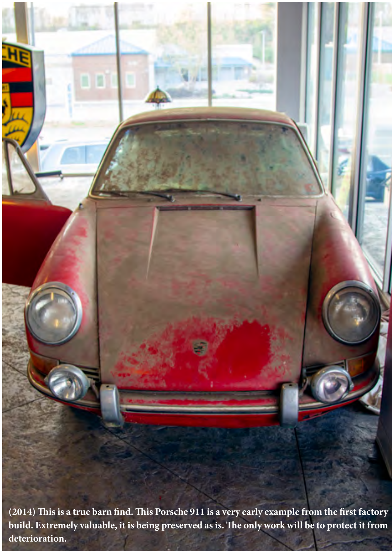
(2014) This is a true barn find. This Porsche 911 is a very early example from the first factory build. Extremely valuable, it is being preserved as is. The only work will be to protect it from deterioration.