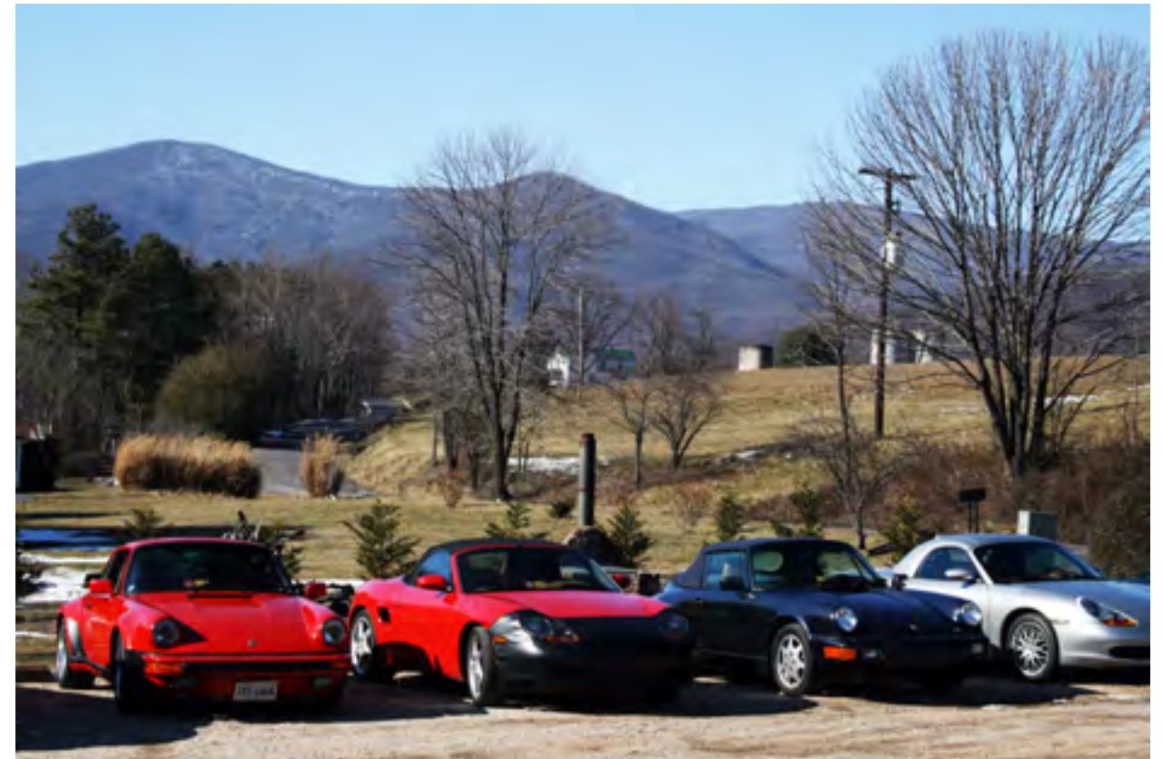
Right: (2007) The Blue Ridge Mountains make an excellent backdrop for this cold group of Porsches at the former Millstone Tea Room near Bedford, VA.