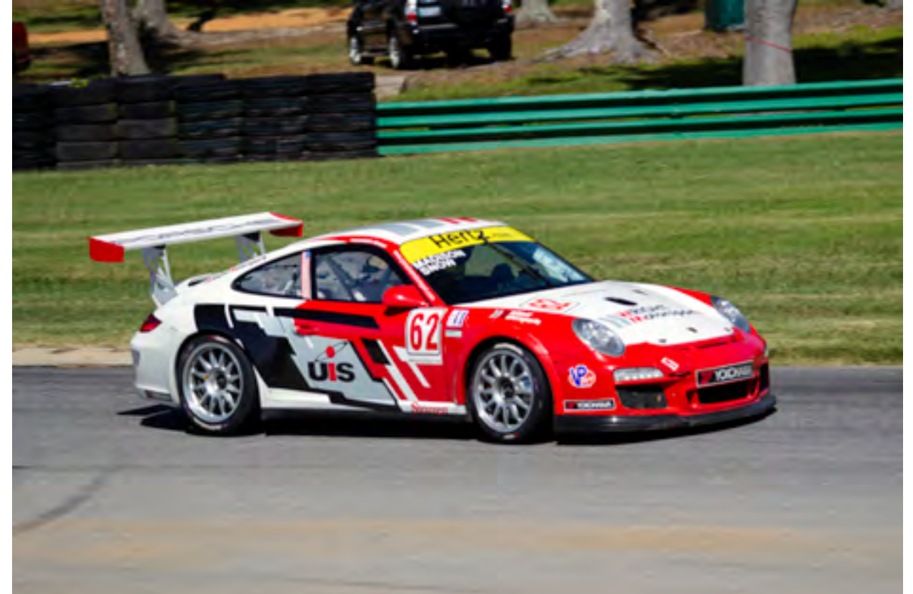
Right: (2012) A Porsche 911 on the racetrack during a race.