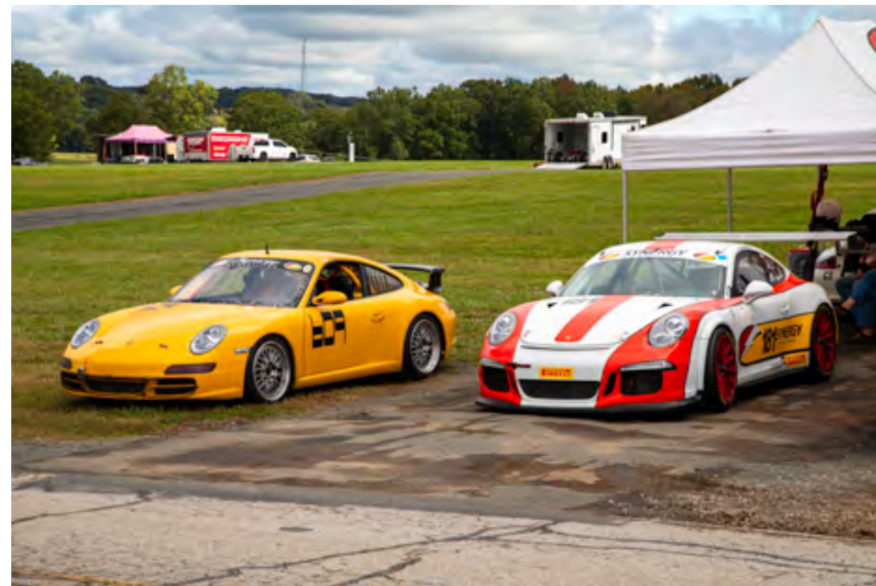
Right: (2020) The Porsche 911 cars of Synergy Racing which has its home at Virginia International Raceway.