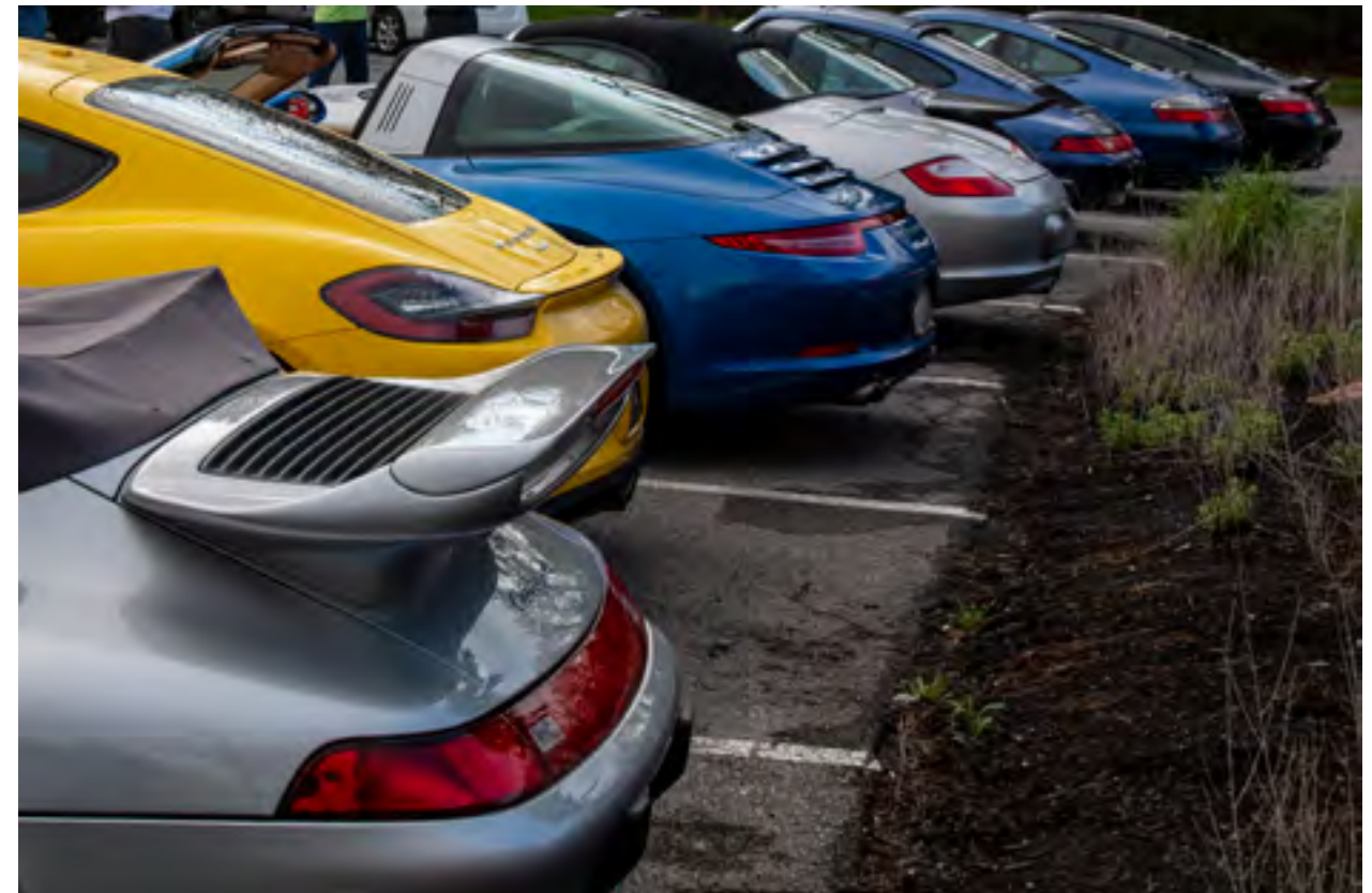
Right: (2017) The different rear shapes of various Porsche models at a car show.