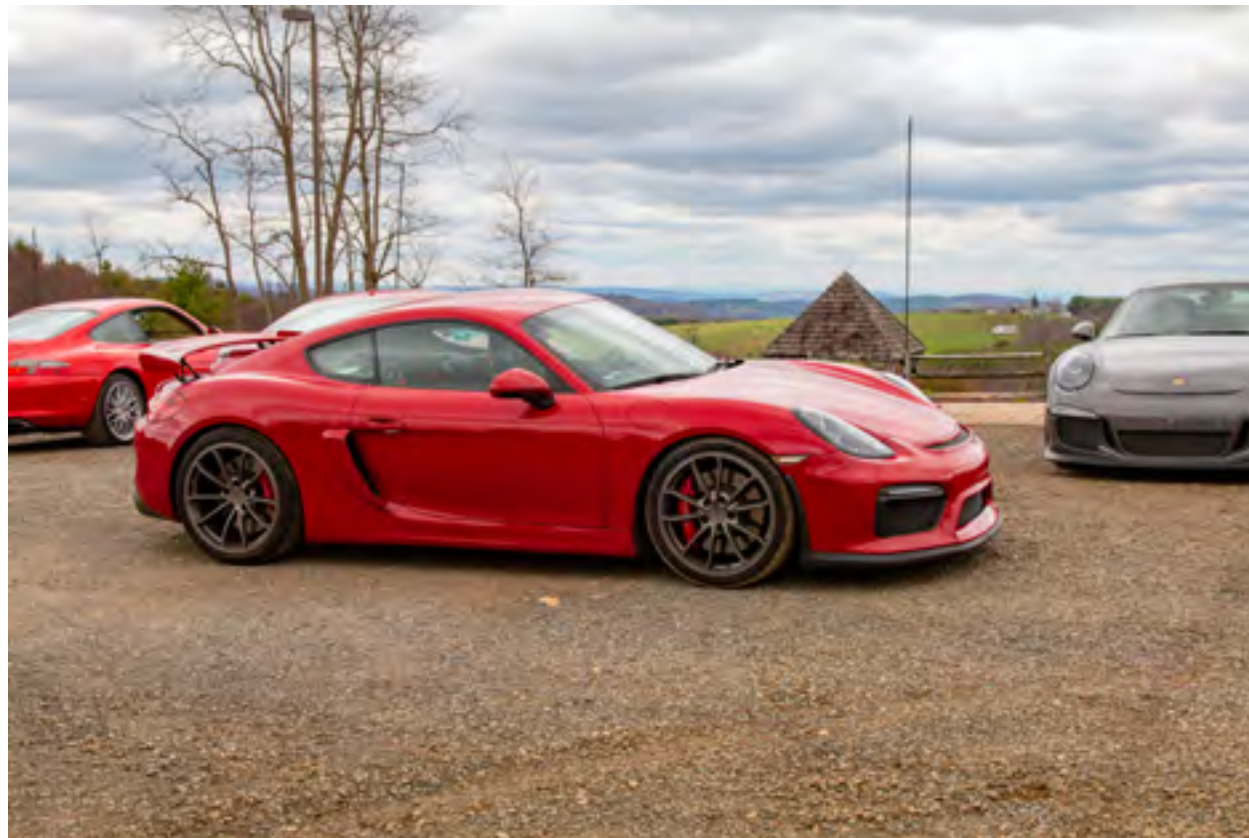
Left: (2018) Porsche Cayman at an event at Chateau Morrisette in Floyd, VA. Do you like red?