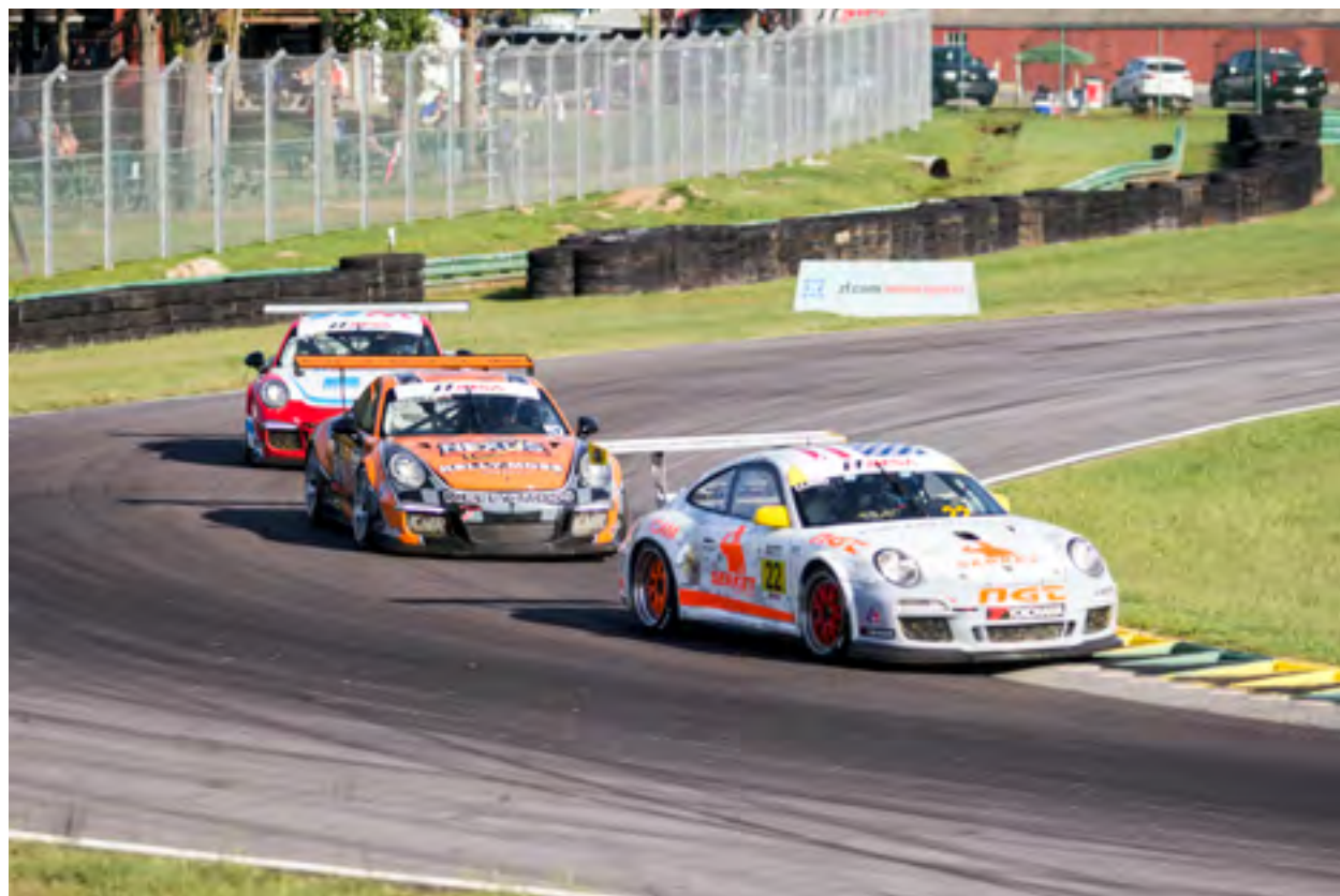
Left: (2015) A Porsche GT3 Cup Challenge race in progress. This corner is the scene of frequent off-track events, but usually no damage.