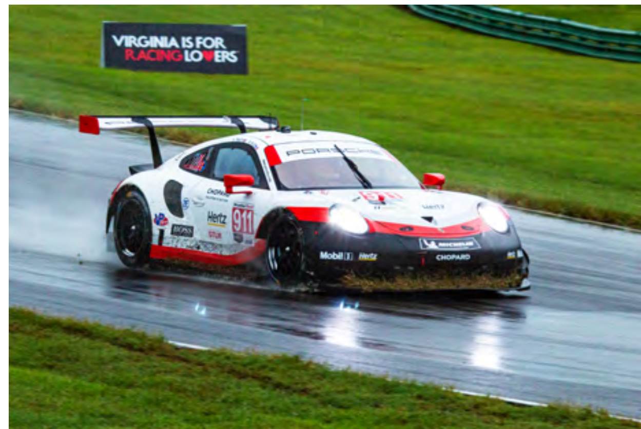
Right: (2019) Judging by the amount of grass in the grill the Porsche #911 has been “mowing the grass” in an off-track excursion. A wet track provided a challenging handling experience for drivers.