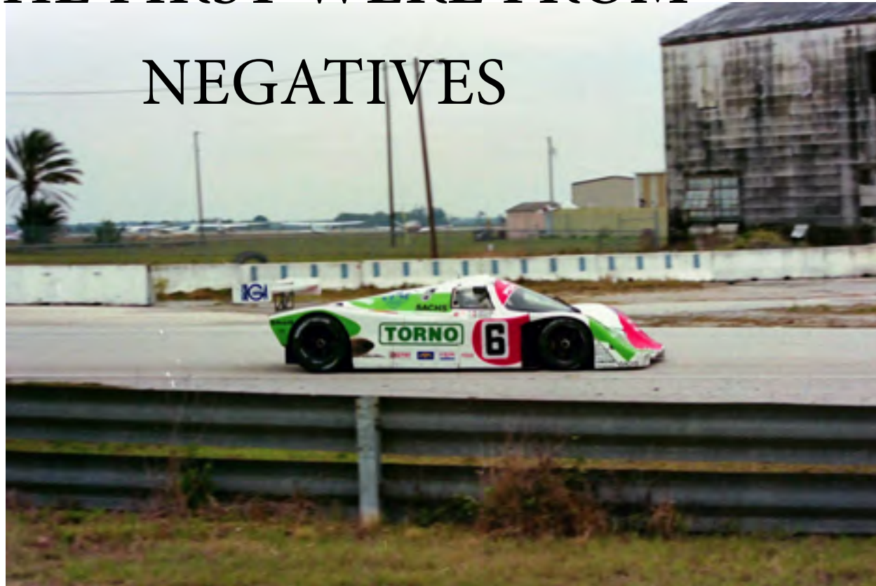
Left: (1988) Torno Porsche prototype car at Sebring International Raceway in Sebring, FL. If you like racing, the sights, sounds, and smells at the track make the experience.