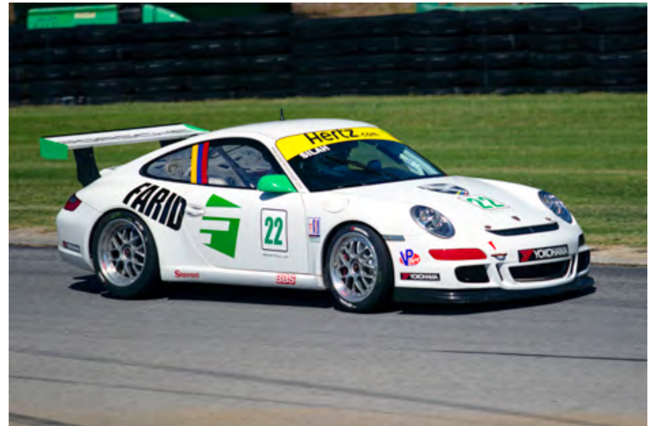
Right: (2012) A Porsche 911 on the racetrack during a race.