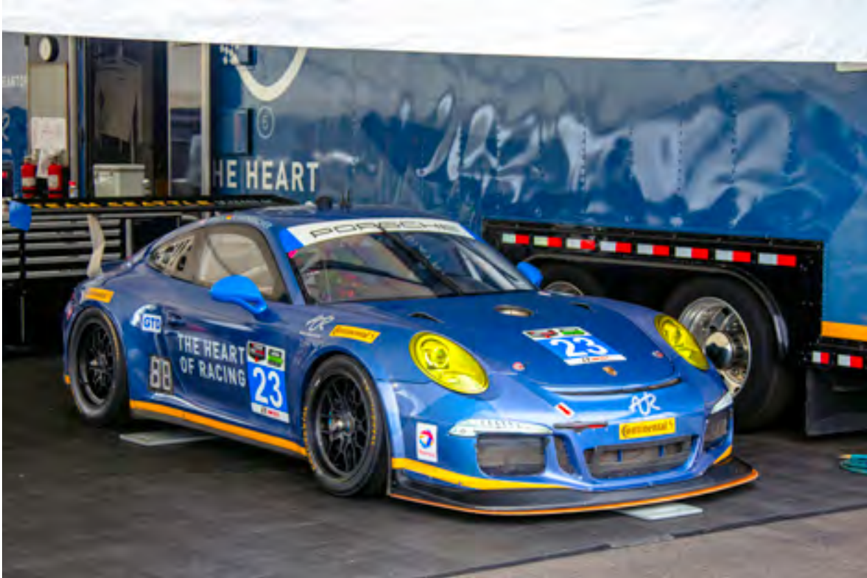
Right: (2014) The Heart of Racing Porsche 911 is ready for competition. The crew finished final preparations and rolled it to the front.