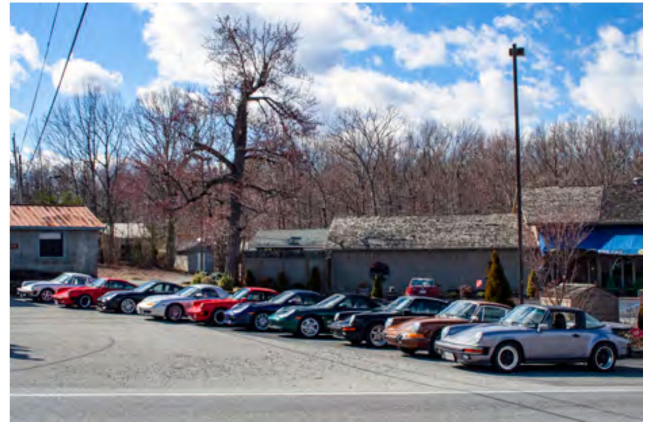
Right: (2008) A line of Porsches outside a Moneta, VA restaurant. Owners braved the cold February temperatures for me to get this photograph.