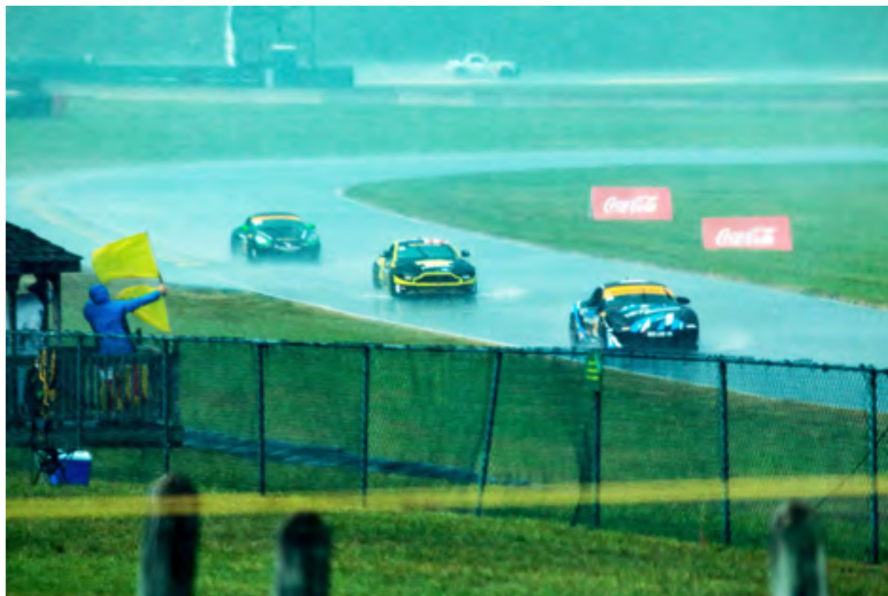
Left: (2016) A full course caution caused by heavy thunderstorm rain delayed this race. Rain tires were not adequate for this amount of rain. The red flag came soon after.