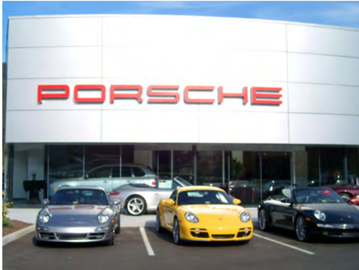
Left: (2006) The Porsche dealer in Roanoke, VA opened. It was a convenient location for the area, but it did not stay long.