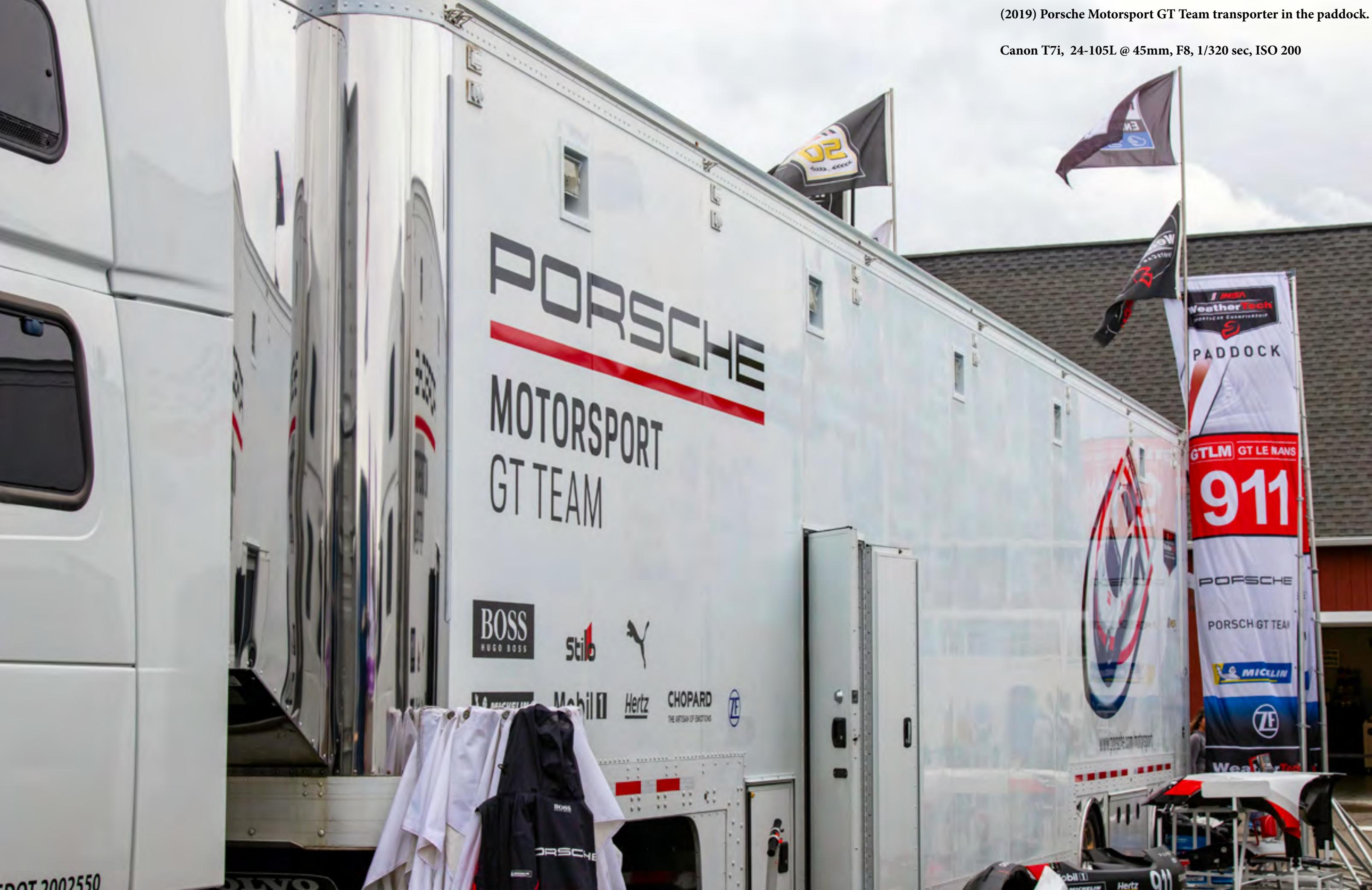
Canon T7i, 24-105L @ 45mm, F8, 1/320 sec, ISO 200