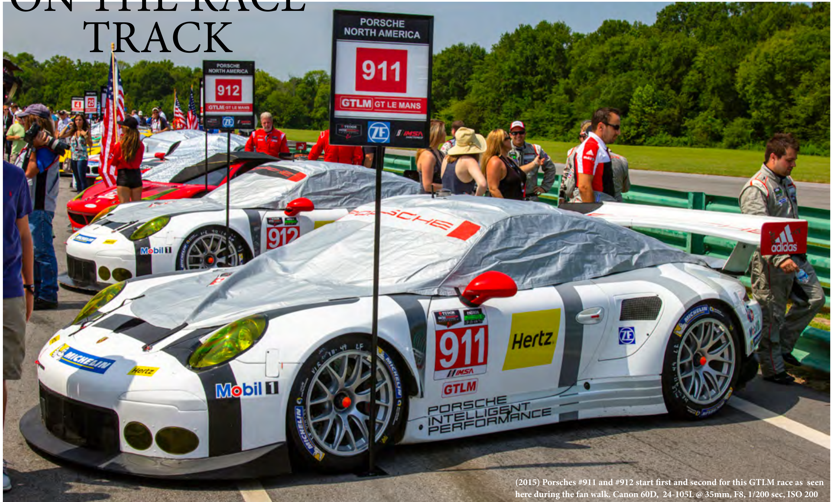
(2015) Porsches #911 and #912 start first and second for this GTLM race as seen here during the fan walk. Canon 60D, 24-105L @ 35mm, F8, 1/200 sec, ISO 200