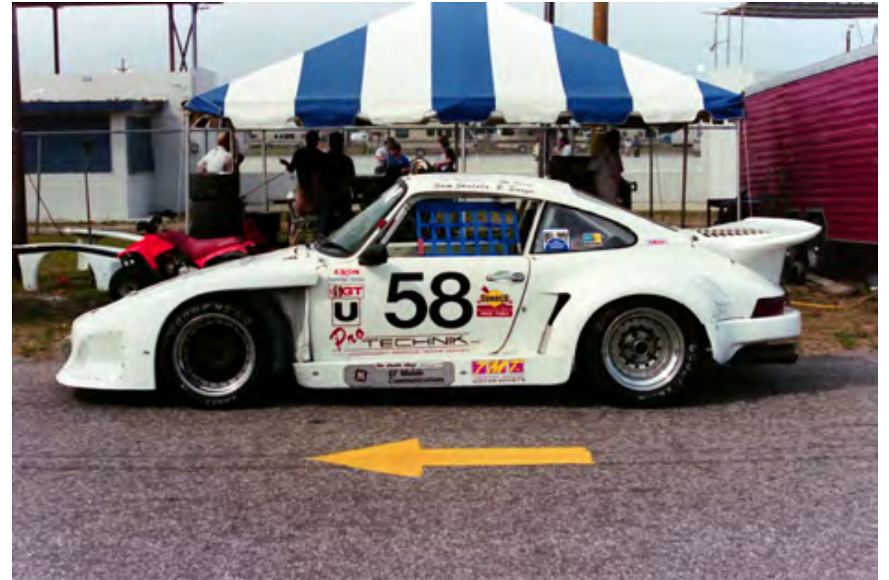
Right: (1988) This Porsche GTU car had 2-way radios from GE Mobile Communications in Lynchburg, VA. At that time radios in race cars was in its infancy.