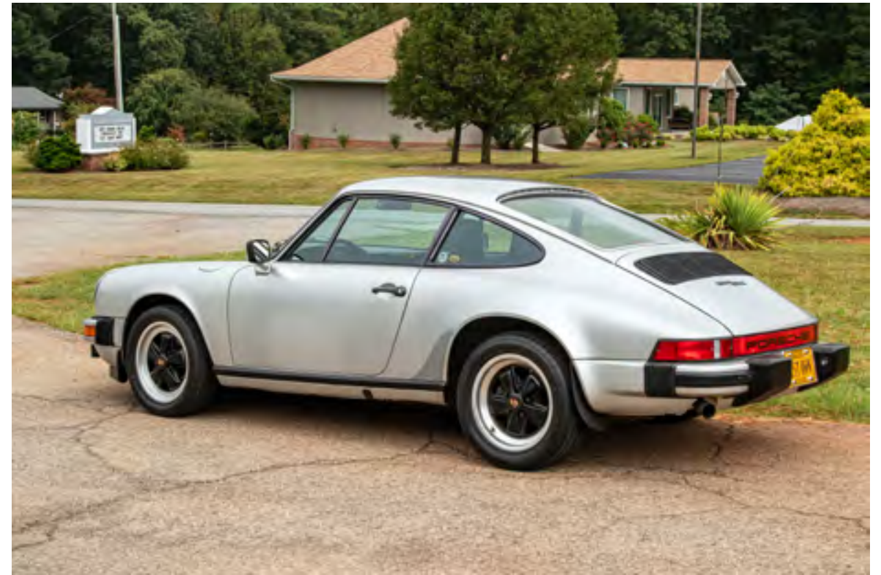
Right: (2019) Porsche 911 coupe is timeless. Since 1963 the 911 remains in production and very similar in shape.