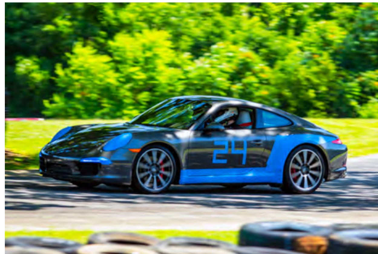
Right: (2013) This Porsche 911 driver negotiates Oak Tree Turn at Virginia International Raceway during a Driver Education event.