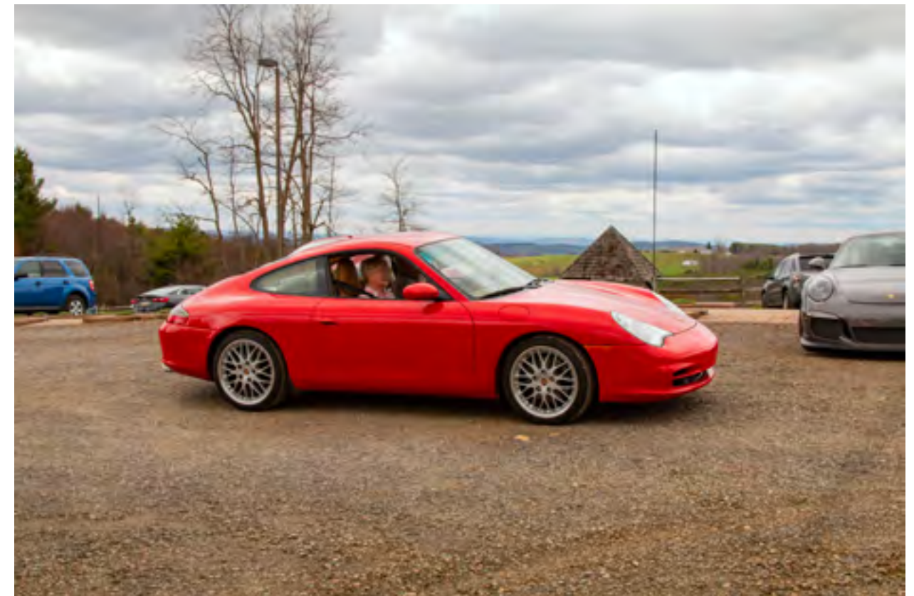
Right: (2018) Porsche 911 Carrera at an event at Chateau Morrisette in Floyd, VA. Older than the one above, the shape remains the same.