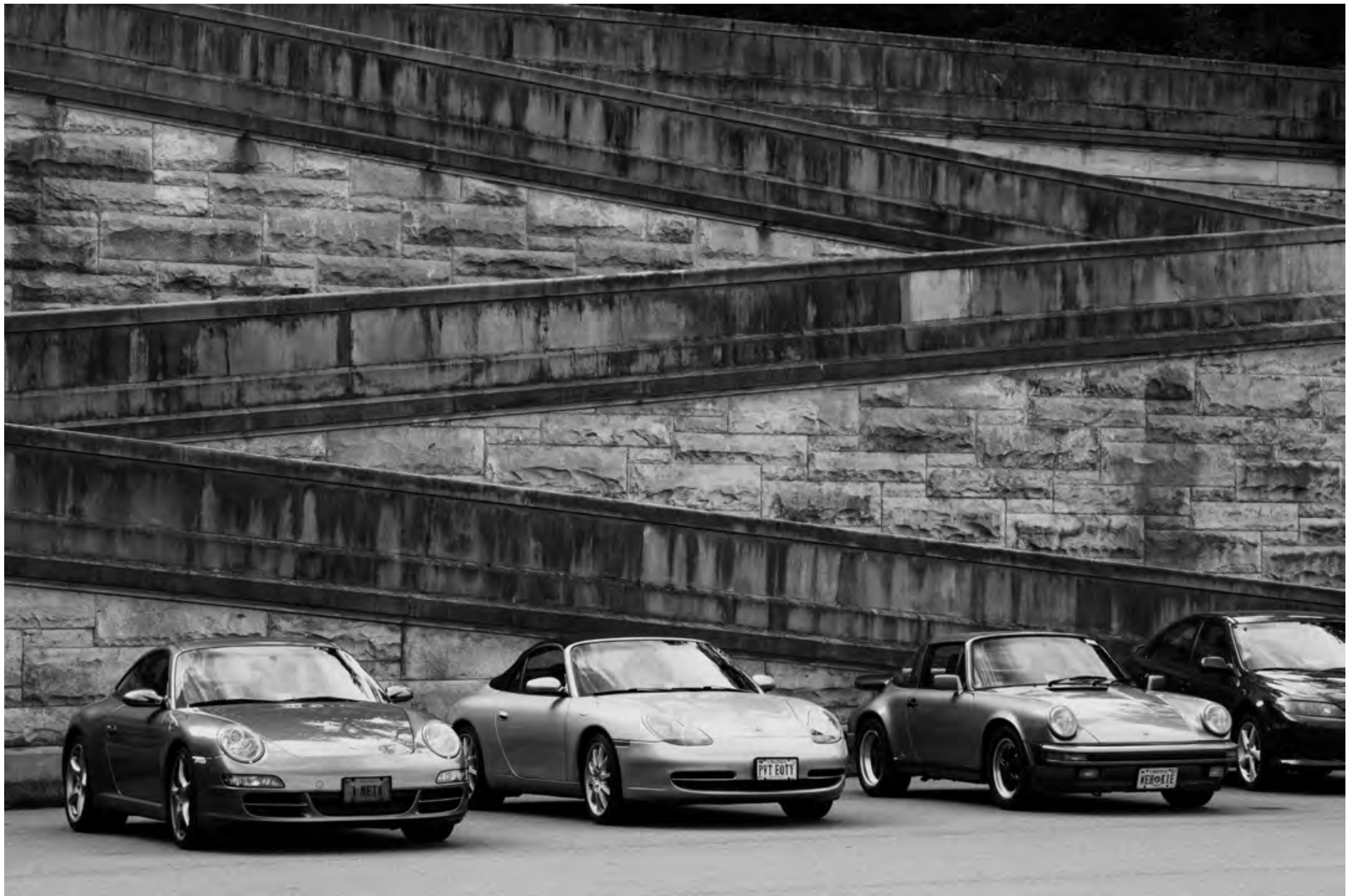
(2012) Steps going up a wall to the top of a hill, at the Biltmore Estate in Asheville, NC, adds horizontal aspects to the rounded cars.