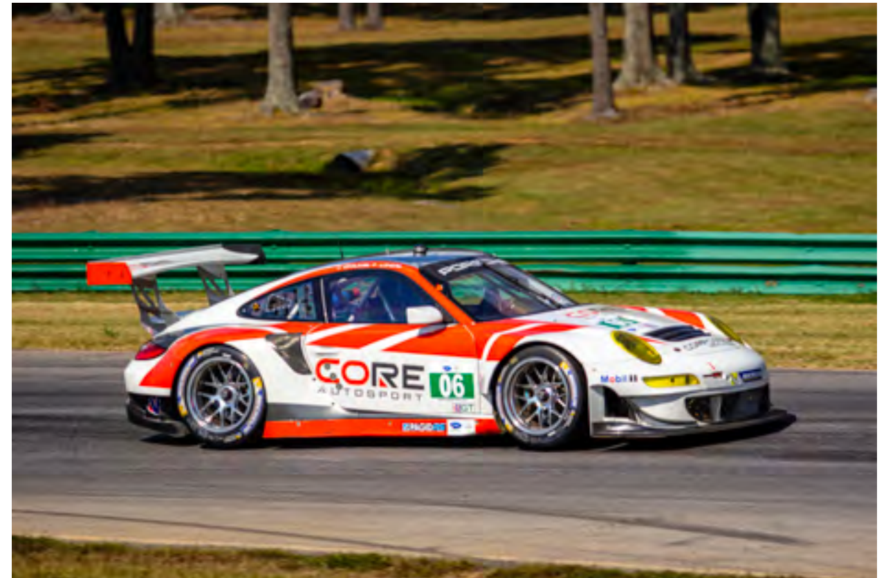
Right: (2013) A Core Autosport Porsche 911 on the racetrack during a race.