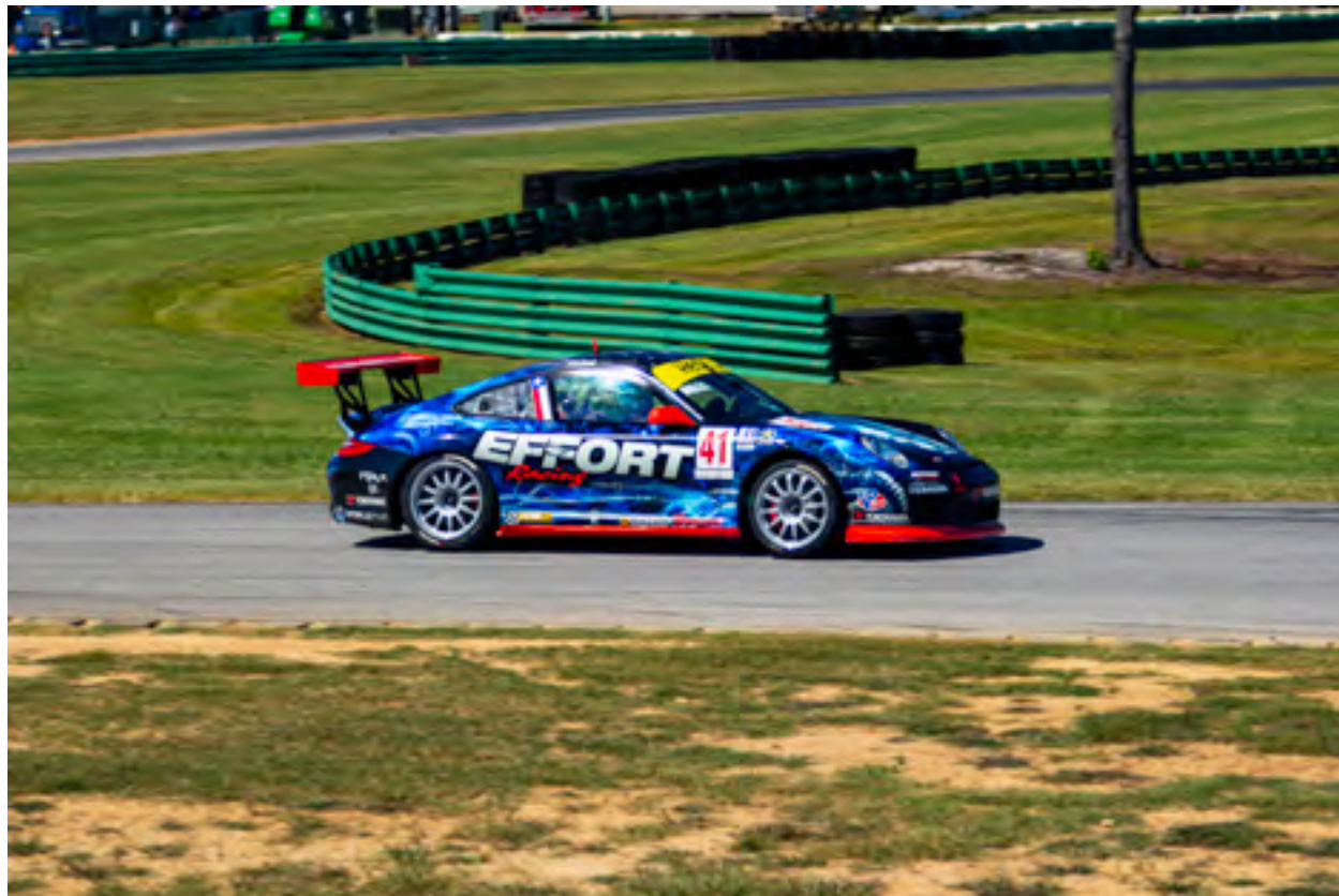
Left: (2012) A very colorful Porsche 911 from the Effort Racing team on the racetrack during a race.