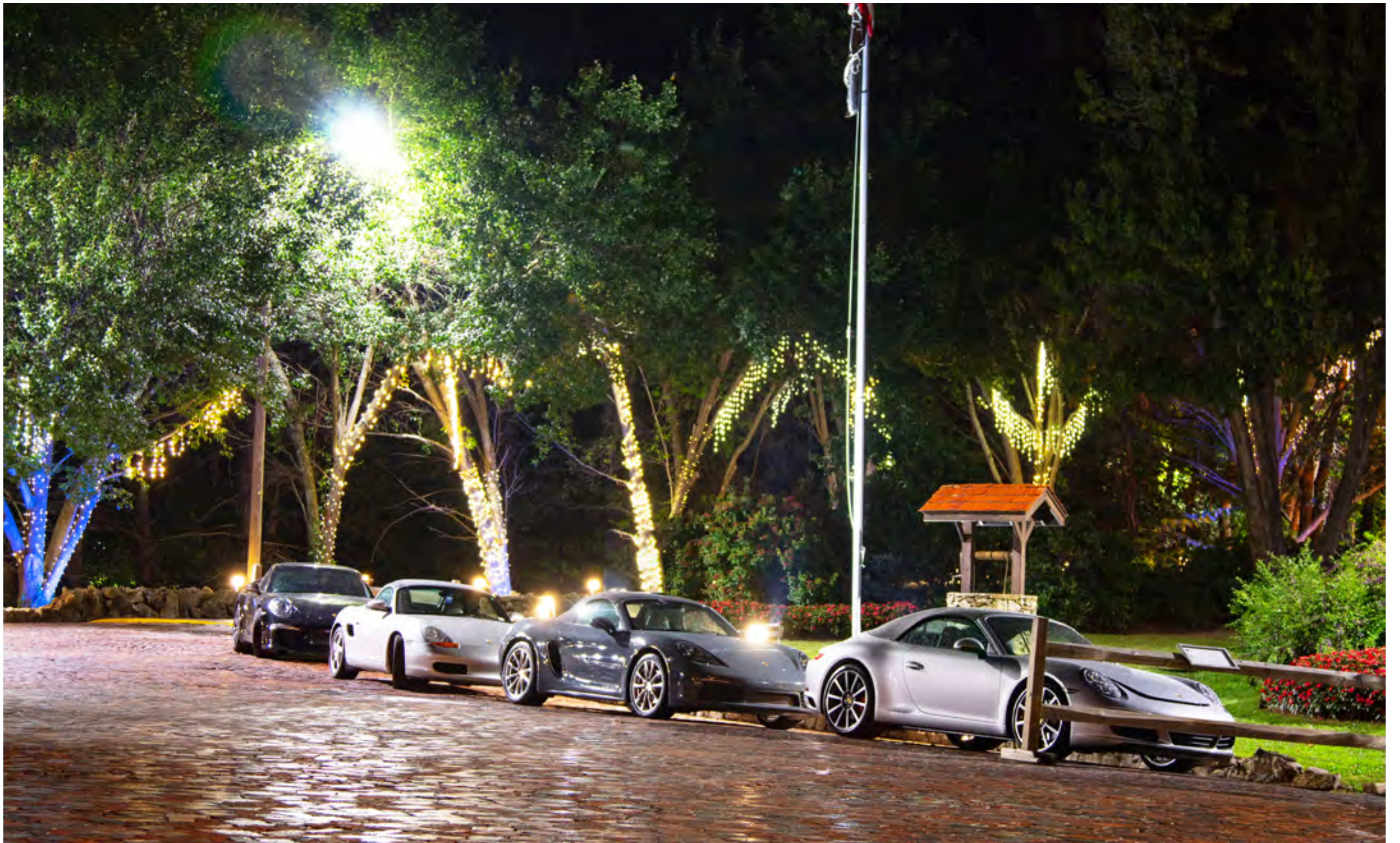
(2017) Night at the Omni Grove Park Inn in Asheville, NC. These four Porsches were parked in front of the lobby entrance, and there was light rain falling making everything shiny and the picture more appealing. There were around 200 Porsches there for a car club event. Canon 70D, 24-105L @ 47mm, F4, 3.2 sec, ISO 100