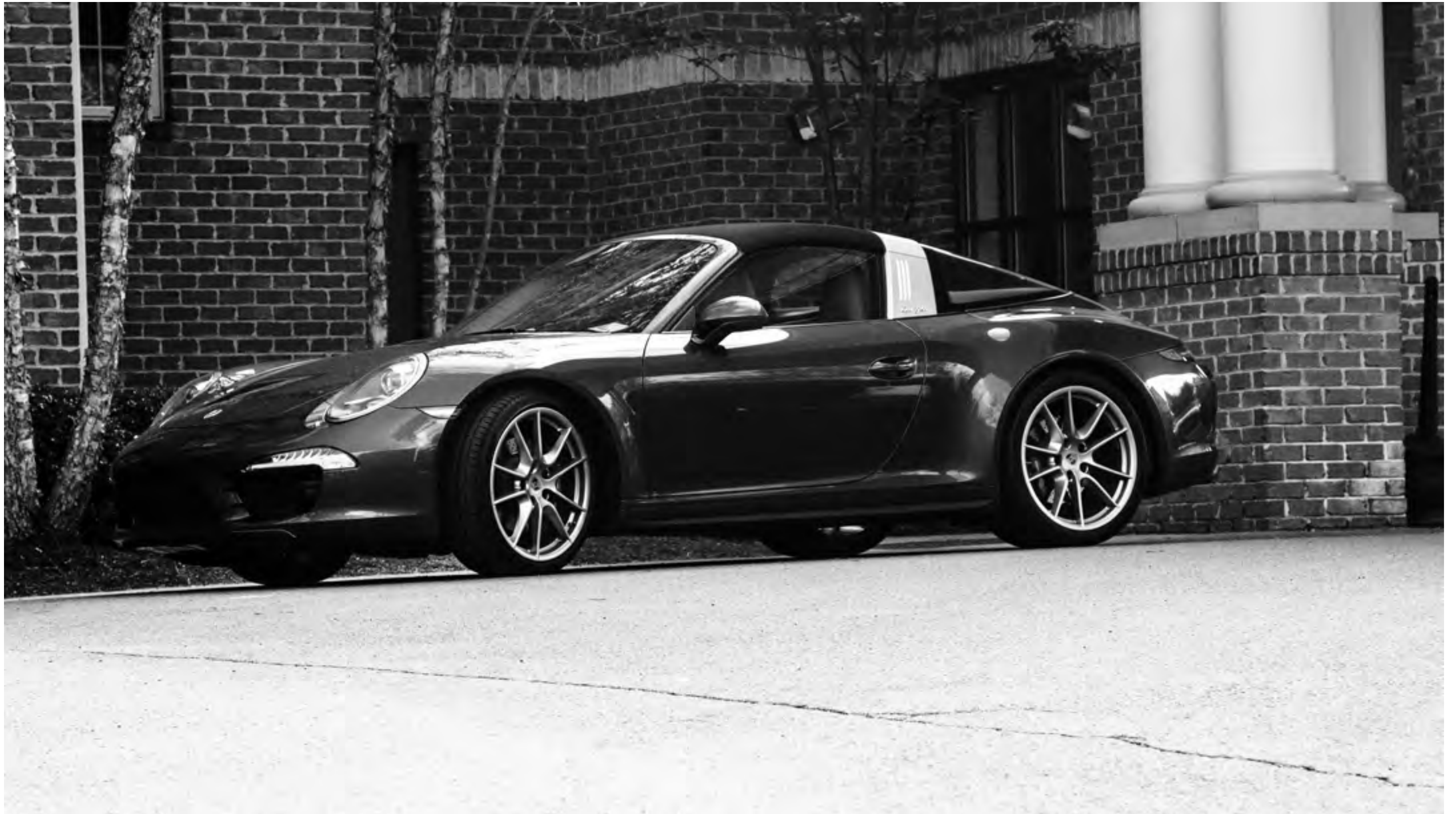
(2019) I shot this black and white photograph for the contrast between the light pavement and the dark car. This Porsche 911 Targa was at The Resort at Glade Springs in Daniels, WV. I also did the same shot in color, but I cannot decide which I like better. I often shoot in both color and black & white to have different views of the same thing.

Canon 70D, 24-105L @ 93mm, F6.3, 1/320 sec, ISO 200