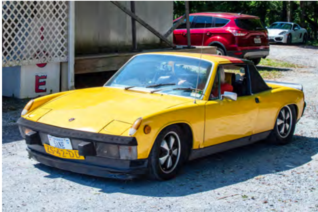
Left: (2019) The Porsche 914 was Porsche's entry level car in the 1970s. Made by Volkswagen and with a mid-engine, it was a great handling car on twisty roads, and it remains popular today.