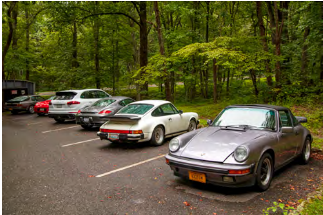
Left: (2020) The light rain did not keep these Porsche owners from the scheduled picnic. By early afternoon the sky cleared making the return trip more pleasant. Several Porsche types and models were represented.