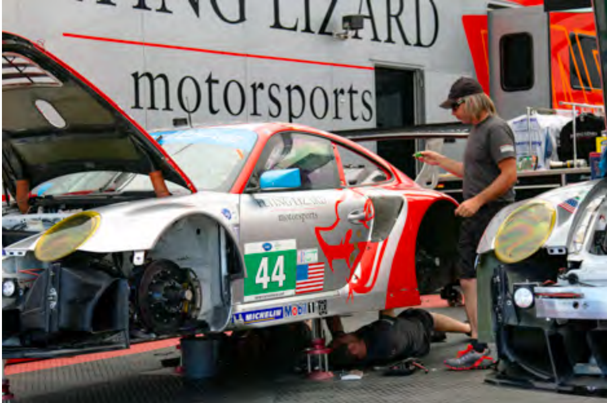
Left: (2012) The Flying Lizard Porsche #44 is prepared for the next round. Some cars have very interesting names and sponsors.