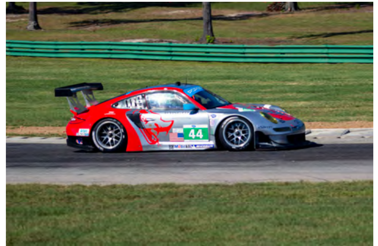
Right: (2012) A Flying Lizard Motorsports Porsche 911 on the racetrack during a race.